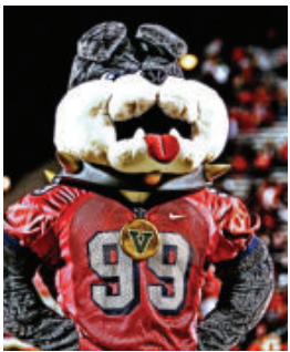
The new TimeOut Spirit Award

The new TimeOut Spirit Award has been established under the Bulldog Pride Fund , an endowed scholarship of the Fresno State Alumni Association.