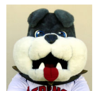
TimeOut Junior Animal Science; Class of 2015

Thank you for supporting me, believing in me, and investing in me.